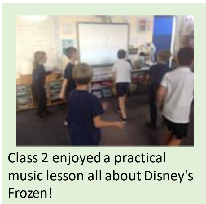
Class 2 enjoyed a practical music lesson all about Disney's Frozen!