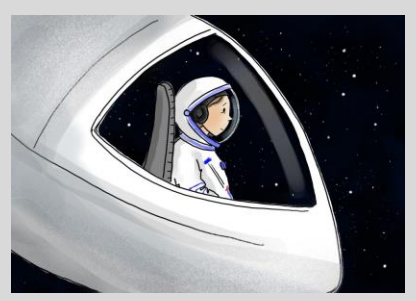
Theatre Alibi – Down to Earth

Take a picture of your creation with your name and class or it and send it by email to <u>ptfarackenford@gmail.com</u> before the 7<sup>th</sup> November 2020, good luck!